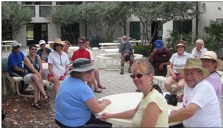
Our prez, near right, in sun-reflecting white and his cool khaki lid during the club's 2009 annual meeting. How many others do you recognize?

We must express our appreciation to the Marjorie Stoneman Douglas Nature Center for making their courtyard and covered area available for our use. We were protected in a covered area from any kind of weather while also having the outdoor tables and courtyard available; the words perfect and delightful fit the setting. Being in a lovely natural area of forest and dunes along one of the most beautiful beaches in the state made all of us come away feeling that we had been in a world apart, refreshed and calm. We are